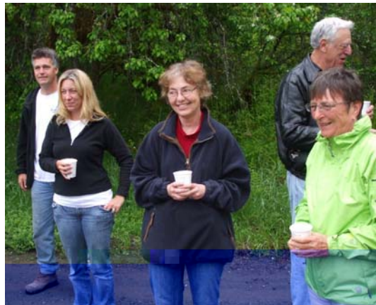
Bright, early morning smiles as we enjoyed coffee and muffins on Camp Road, which cuts through the orchard