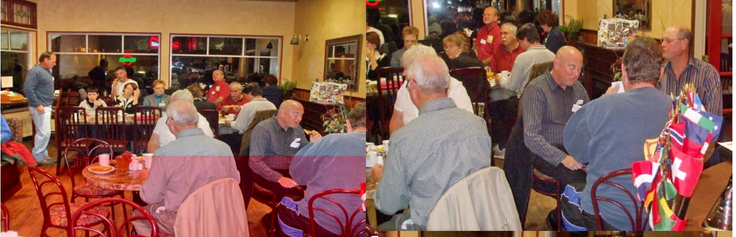
Sharing Rotary at our meeting on 14 October