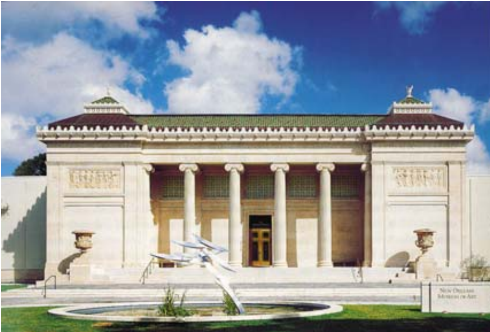
New Orleans scenes - New Orleans Museum of Art