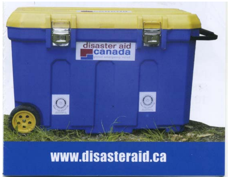
The Disaster Aid Canada Box.