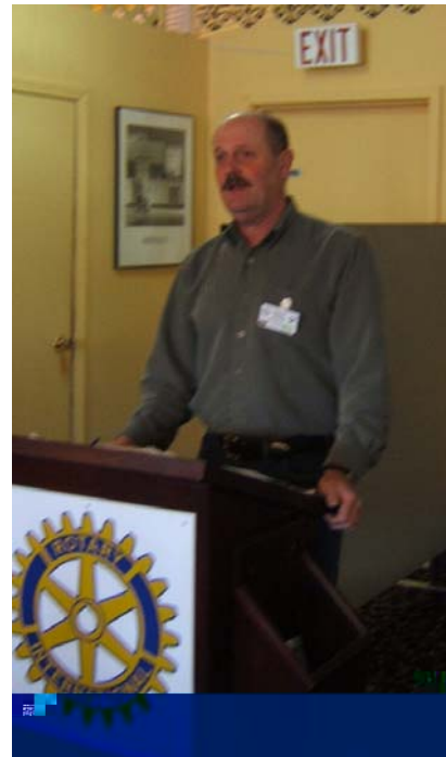
One more meeting to go. Only a few Grab and Go Bags left!