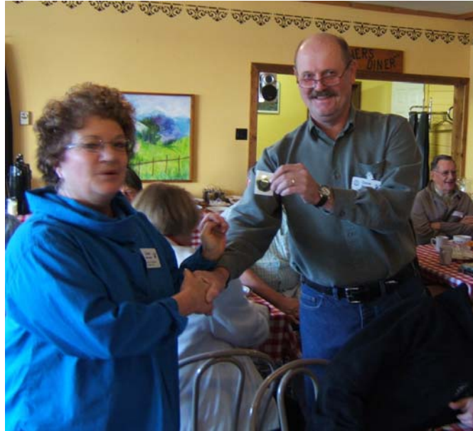
Another Presidential Seal for Gale!