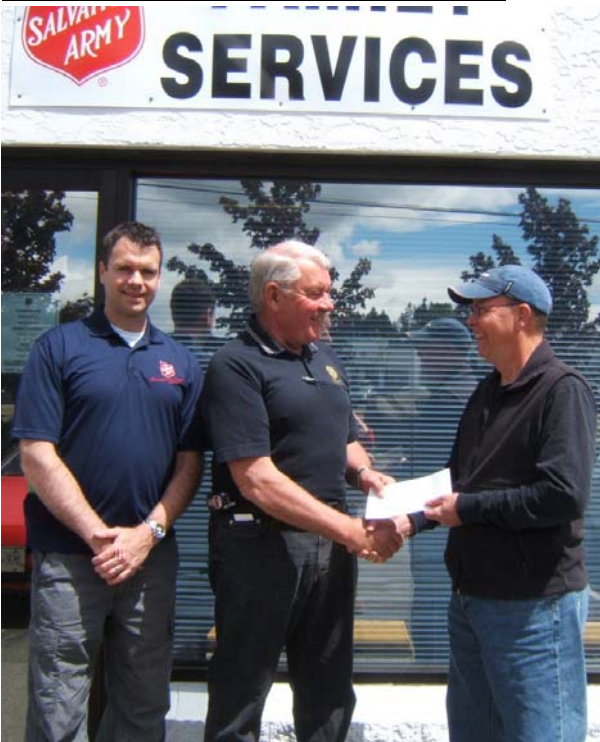
Presentation of cheque for $1,500 from all four Rotary Clubs for young Sailors.