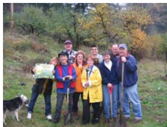
The Happy Planter Gang!