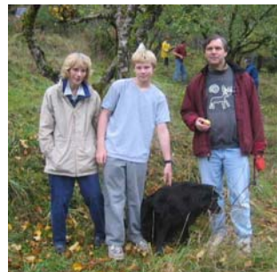
The Girody Family